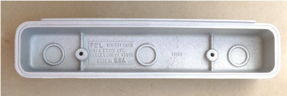
Image of the interior of these valve covers showing the reinforced rings for machining:

If needed, holes to accommodate PCV, oil fill and breathers can be machined in three possible locations on these PML valve covers. The interior has reinforced rings for this custom machining.