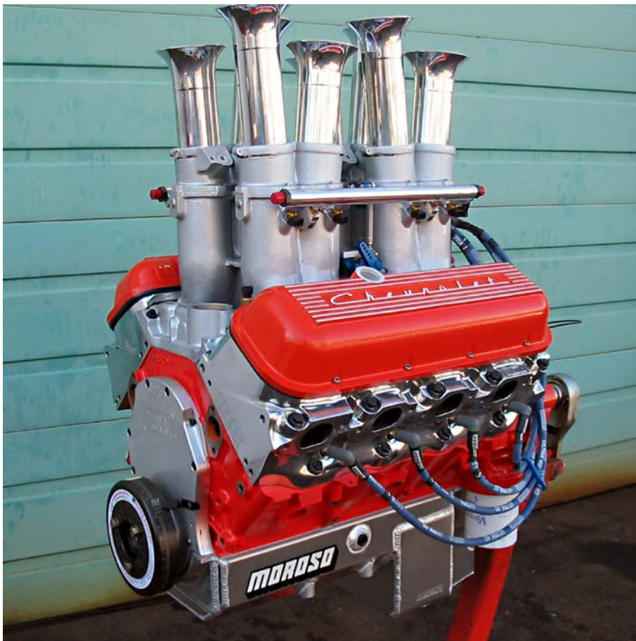
PML valve covers with CHEVROLET scrip and fins, tall height, orange powder coat finish, PML Part Number 9739, installed on a 540 motor.