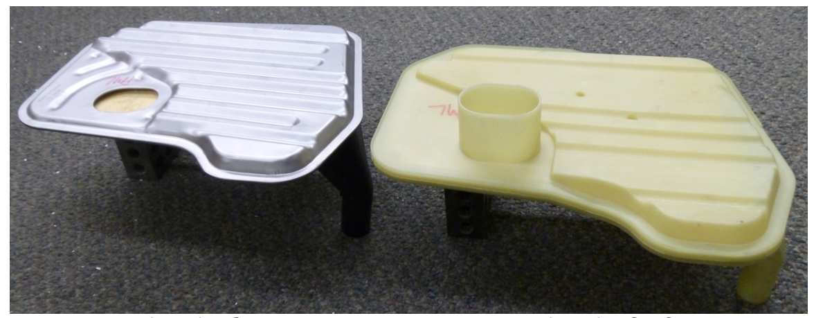
4L60E filter for GM shallow pan

If you have a 4L60E with the GM shallow pan, you can also use a C5 Corvette (1997-2004) filter with the 8650 pan. The advantage to this filter is that it has an extension at the inlet that will draw oil from deeper in the pan. This filter cannot be used in a 1999 and newer vehicle that came stock with a GM deep pan.